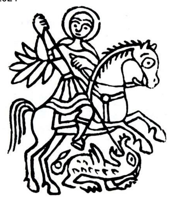
Coptic Tattoo Design by Anatta Vela