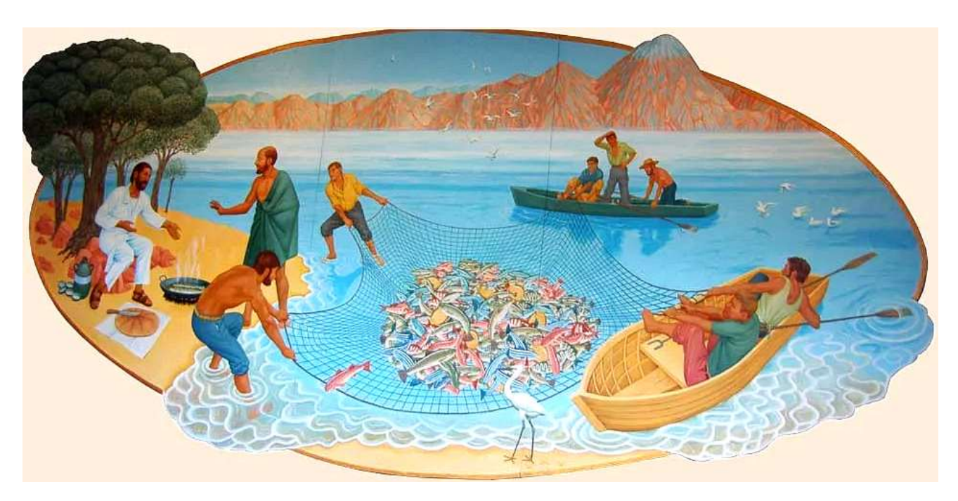
Image: Koenig, Peter "Breakfast on the Beach" (Kettering, United Kingdom)