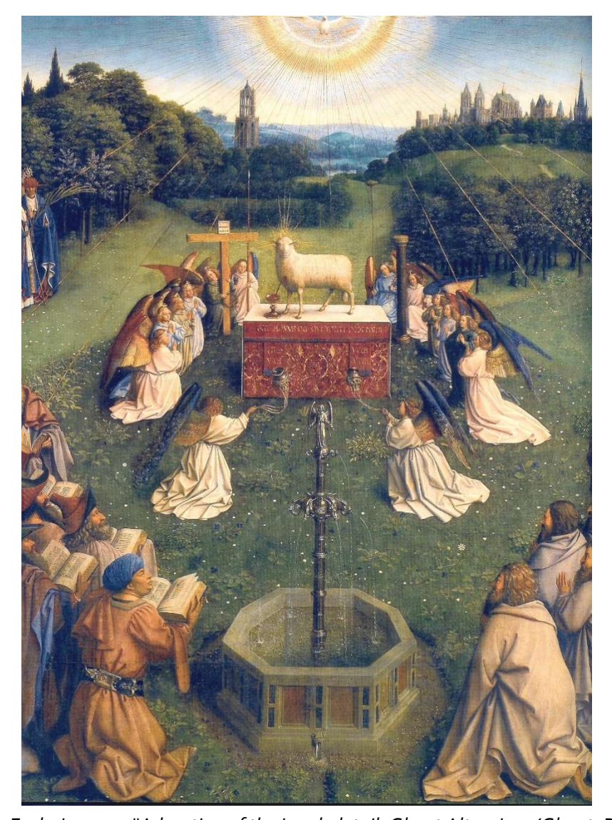
Image: Eyck, Jan van. "Adoration of the Lamb detail, Ghent Altarpiece (Ghent, Belgium)